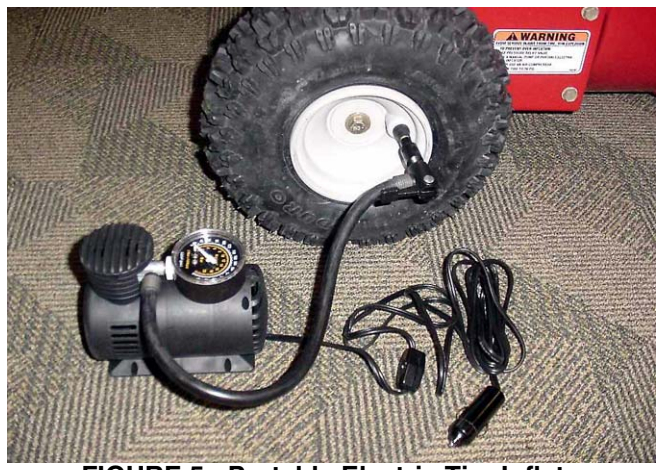
FIGURE 5 - Portable Electric Tire Inflator

6. Verify tire pressure as instructed in the Checking Air Pressure section.