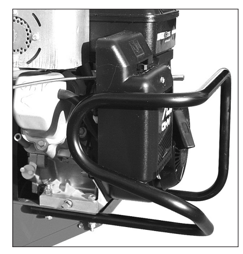
Figure 2: Loosely attach bumper to right side engine support bracket and base of engine. Tighten all four screws securely.

For customer assistance, visit www.troybilt.com, contact your nearest authorized dealer or: